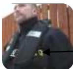
Pouch with belt loop