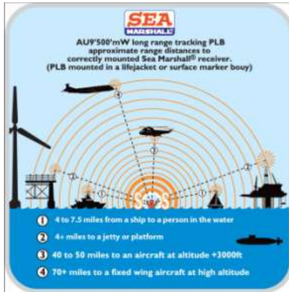
500 mW or Long Range AU9