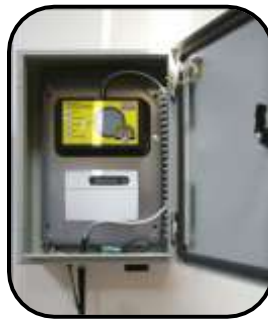
Sea Marshall Base Unit and auto dialer installed in a enclosure

Can the base unit send a message to a computer, say an e-mail providing a message that there is a MOB incident, for example "Emergency, man overboard, dockside at Anderson Ferry dockside, Emergency, man overboard, dockside at Anderson Ferry dockside loading"