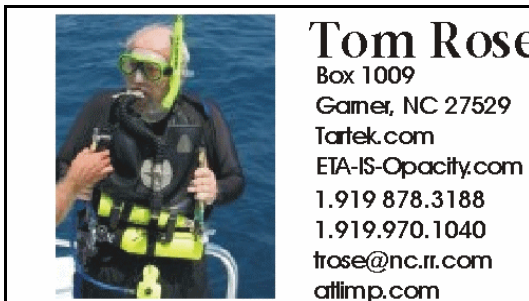
Front of card

An example of my card follows. I print them on business card stock with a home printer.