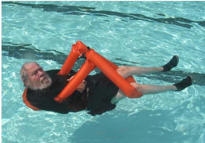
Two sausages snapped together at ends

BCs are great for diving, but not that comfortable at the surface for long immersion or surface swims. The following arrangement made from two six foot safety sausages packs in a small package and makes a very comfortable water bed. No need to wear yourself out treading water.