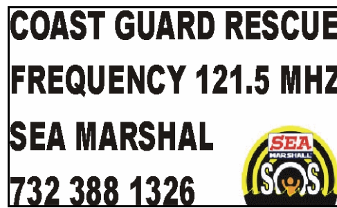
Back of card